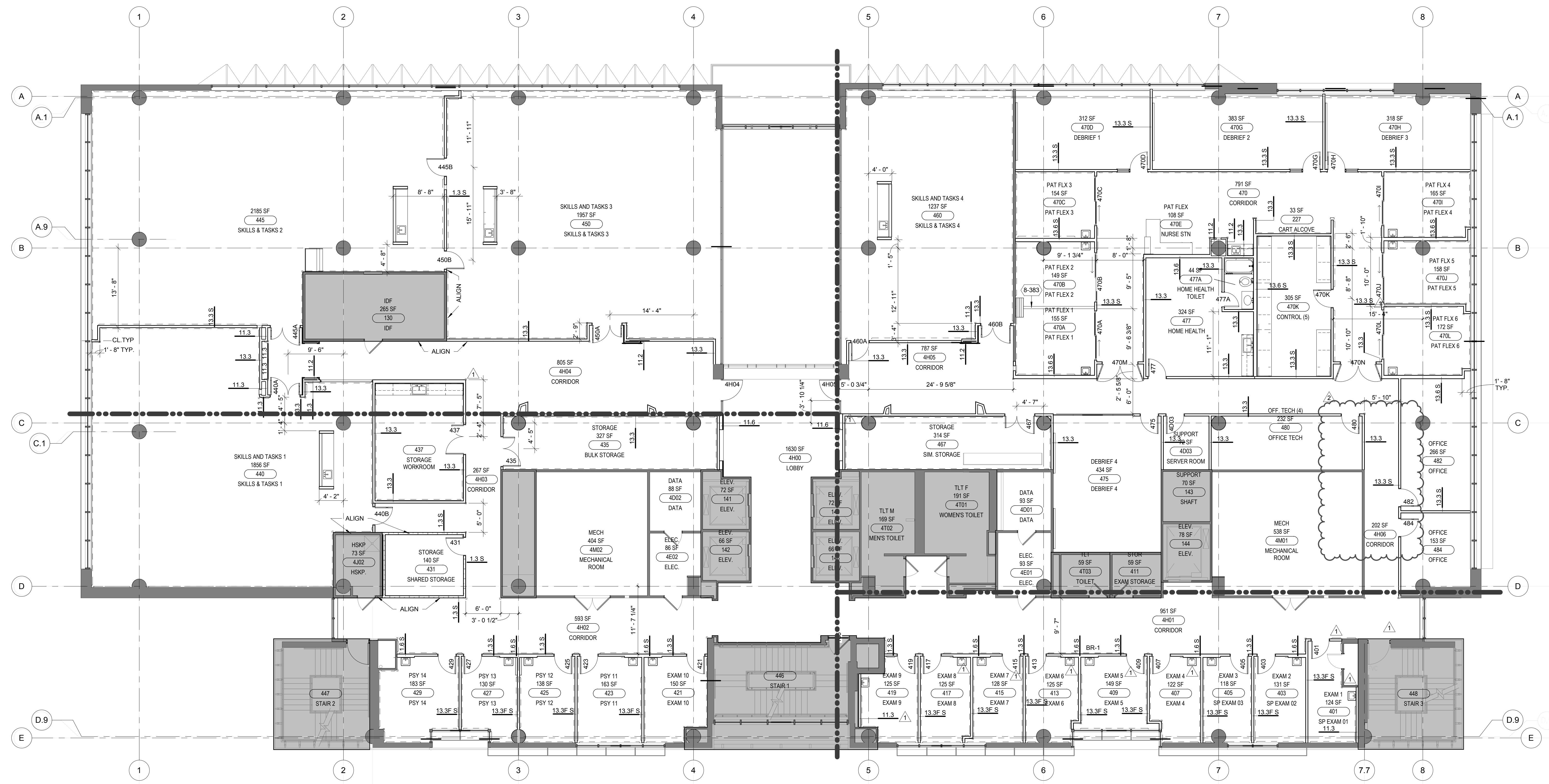
A6 Level 4 - FLOOR PLAN 1/8" = 1'-0"