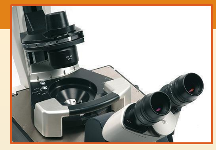
BioScope II scanner (Bruker Inc).