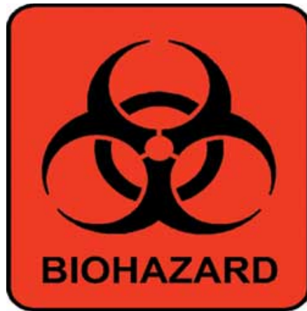
Figure 1: Biohazard Warning Symbol

As a general rule, the location of the posting is predicated by how access is gained to the area where biological hazards are used. In most cases, the door to any laboratory containing an infectious agent should have a biohazard warning symbol posted. In addition, postings should also be displayed in other areas such as biological safety cabinets, freezers, or other specially designated work and storage areas or equipment where potentially infectious agents are used or stored. All individual containers of biological agents should also be labeled to identify the content and any special precautionary measures that should be taken.